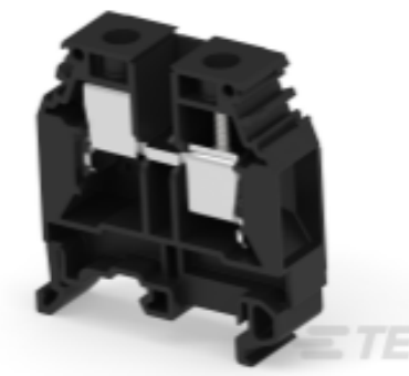
TE Part # 1SNA400191R2600 M16/12