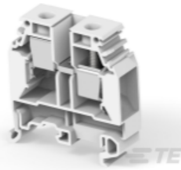
TE Part # 1SNA400193R2000 M16/12