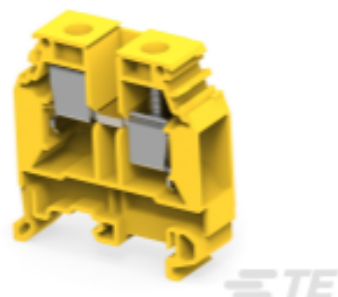
TE Part # 1SNA105129R2300 M16/12