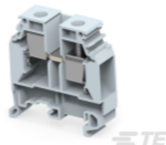
TE Part # 1SNA115129R1400 M16/12